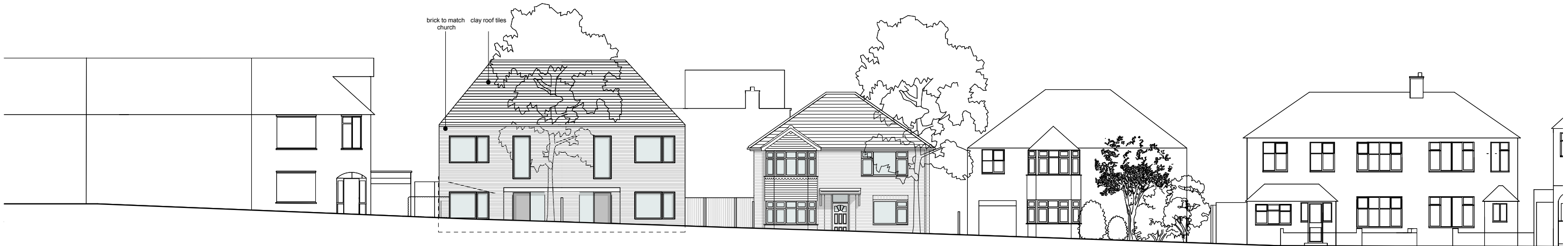
02 | LICHFIELD ROAD ELEVATION scale 1:200